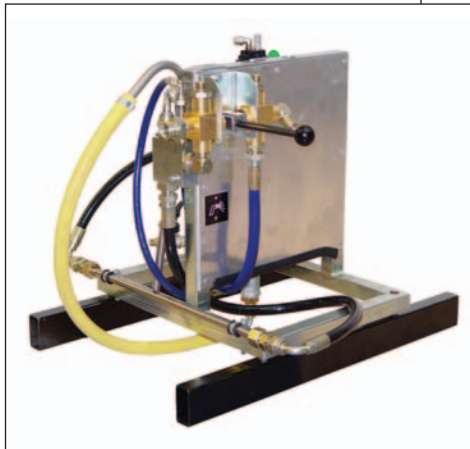
Remote mixer unit (option)